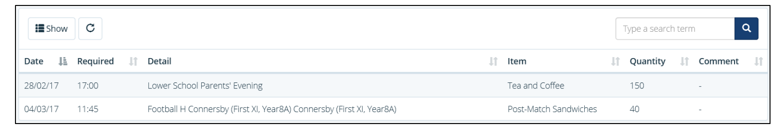
The Facility Zone 'Catering Requests' page

Any requested facilities can be viewed in the Facility Zone. Simply click the appropriate Facility option (Catering, Transport, Resources or Estate), and click 'Requests'.