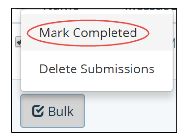
The 'Mark Completed' Bulk option

8. Once marked as completed, you can still view the submission by using the drop-down menu to show 'Completed' submissions. The user's name will have turned green.